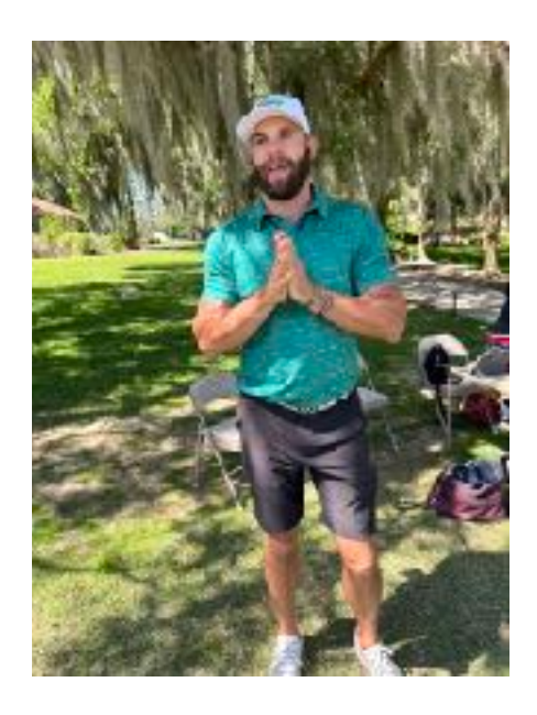
Our long ball hitter.