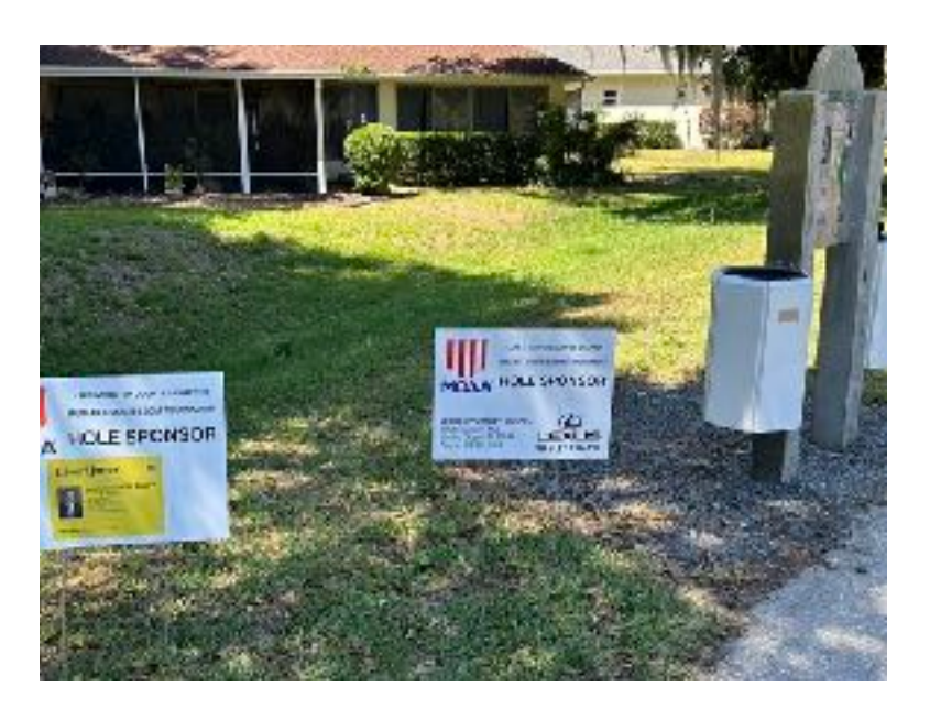
Two of our 28 Hole Sponsor signs.