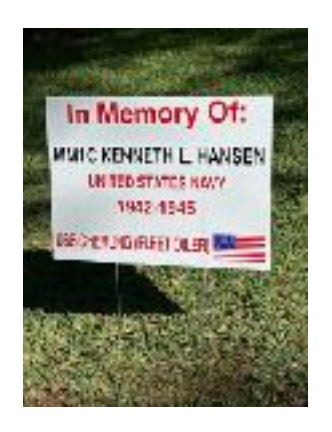
Three of our 42 Remembrance Signs