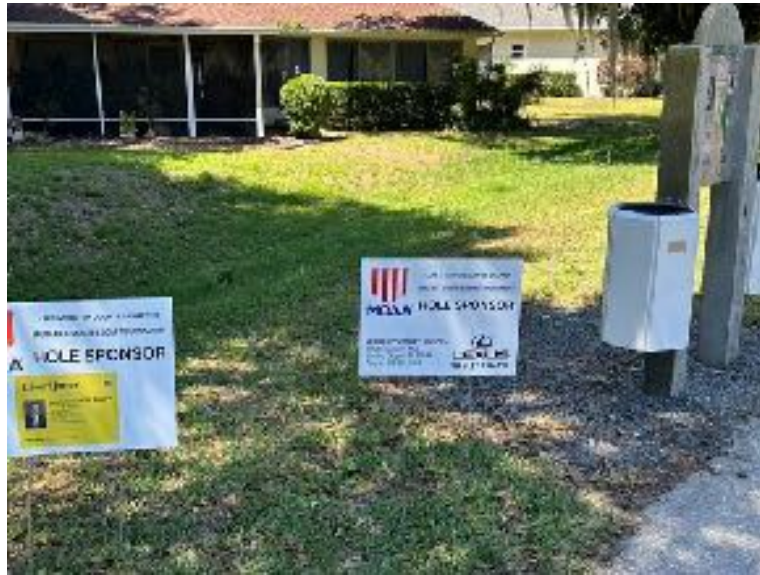
Two of our 28 Hole Sponsor signs.