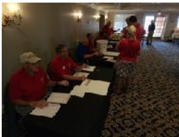
Registration tables ready for action.