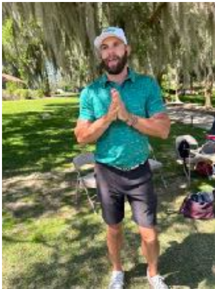
Our long ball hitter.